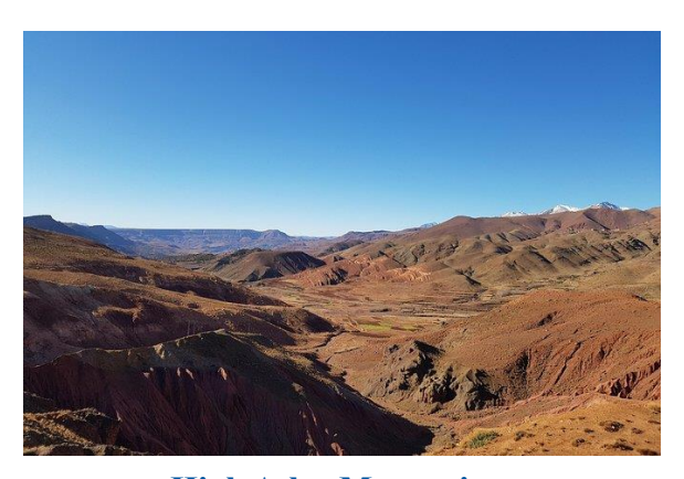
High Atlas Mountains